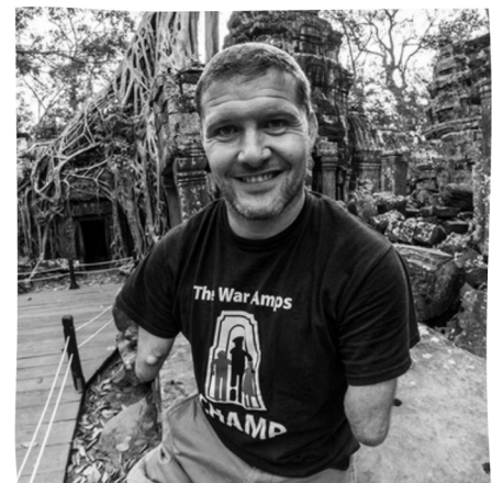
2022 KEYNOTE SPEAKER